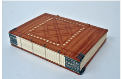
Non-adhesive binding, Matt Stockl