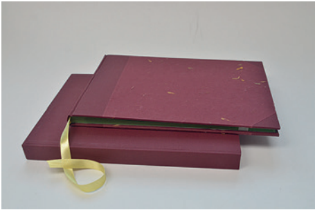
Photograph album and slipcase, Matt Stockl