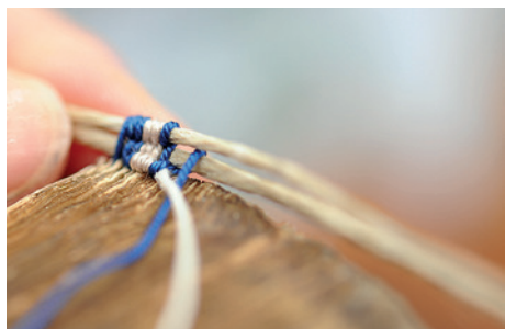
Double core headbands