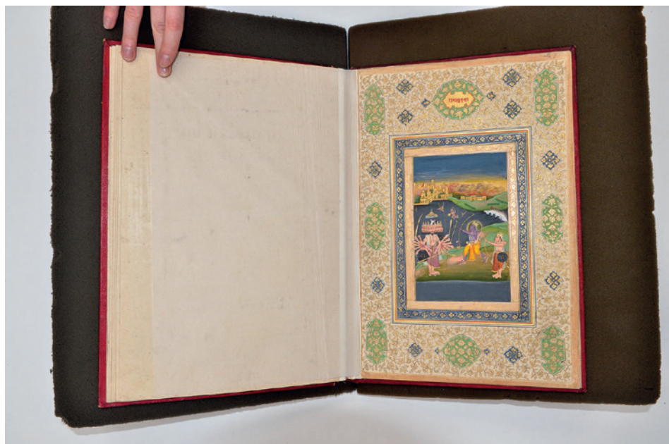
Photographing Royal Collection items