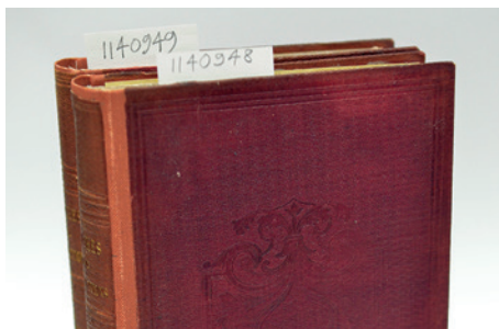
Volumes re-backed in cloth