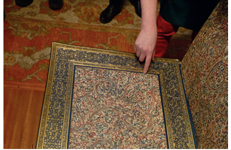
Condition checking at Sandringham