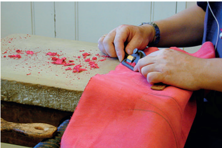
Using a spokeshave