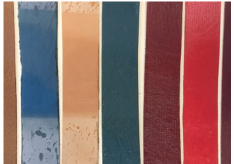
Types of leather