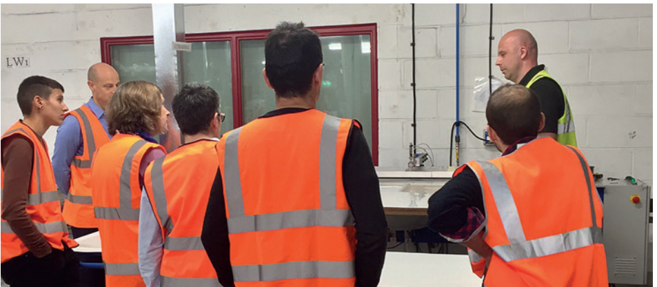
Visit to Conservation by Design, Bedford