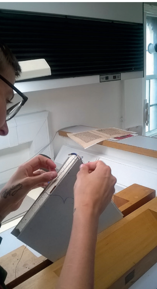
Sewing a headband