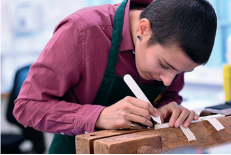
Applying spine linings to a textblock