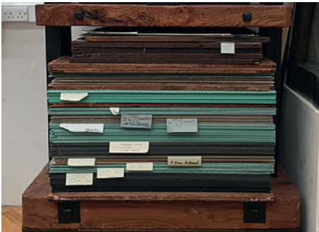
Stock check and organisation