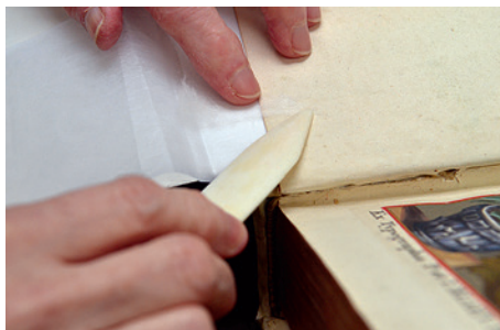
Simple paper repair