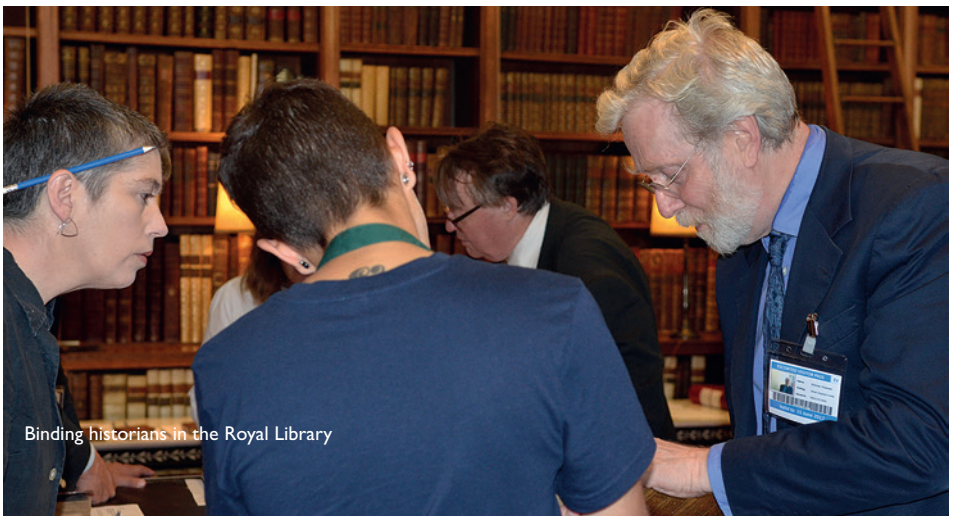
Binding historians in the Royal Library