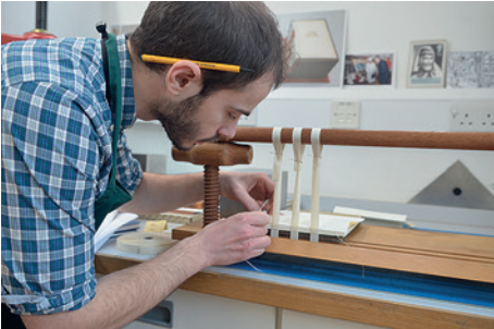
Sewing a textblock