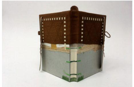
Non-adhesive binding, Ellie Lanham