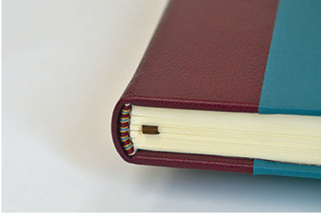
Half leather case binding, Matt Stockl