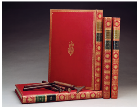
Historical bookbinding research