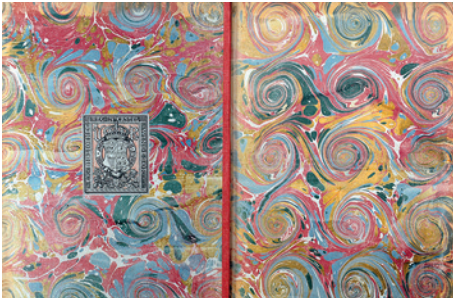
Marbled paper research

Apart from our time spent in tuition and observation of practical work, we continue to research and study the theory and history of bookbinding. This may be guided by the work we are undertaking at a given moment or by our own personal interest in a particular area.