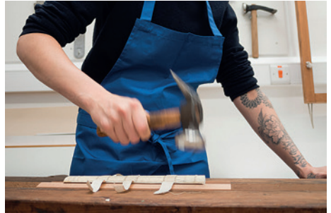
Backing a textblock