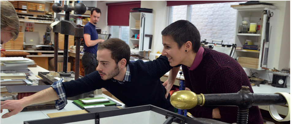
Visit to Temple Bookbinders, Oxford