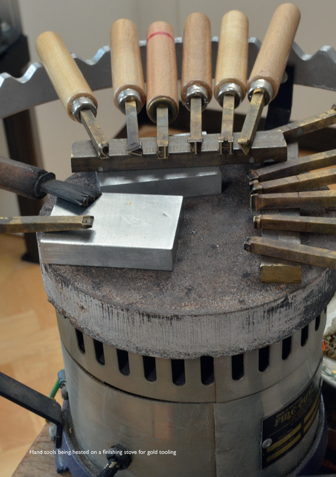
Hand tools being heated on a finishing stove for gold tooling