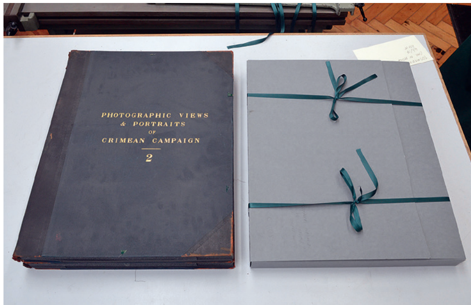
Making folders to house Roger Fenton portfolios