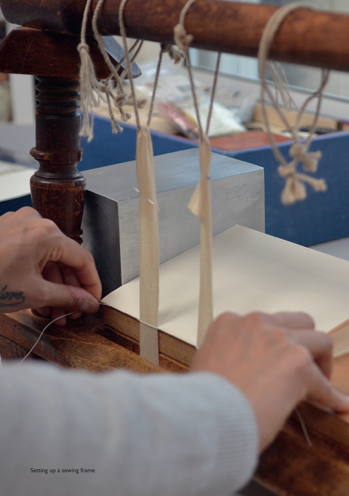
Setting up a sewing frame