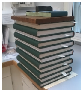
Rebinding of quarterly periodicals into annual volumes