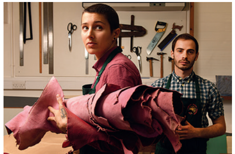
Working with leather