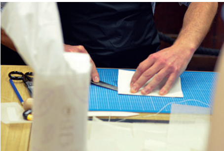
Cutting bolts with a shoe knife