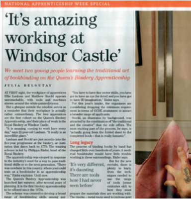
Feature in the Times Educational Supplement