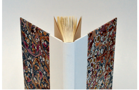
Quarter cloth case binding, Matt Stockl