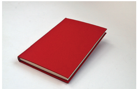
Full cloth case binding, Ellie Lanham