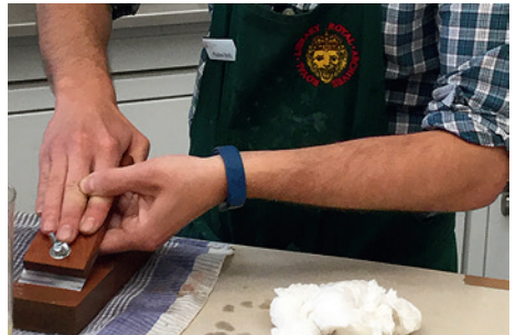
Sharpening a spokeshave