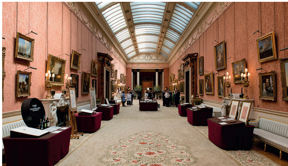
Display for the Spanish State Visit

From our very first week at the bindery we have been involved in the creation, set-up and take-down of numerous exhibitions, both state and public, between Buckingham Palace and the Royal Library at Windsor. We have shadowed colleagues, and been instructed in the packing, transportation and setting up of exhibitions.