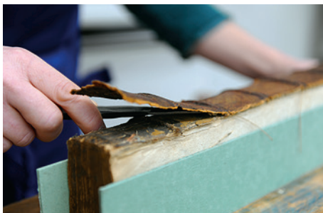
Spine removal for re-backing in leather