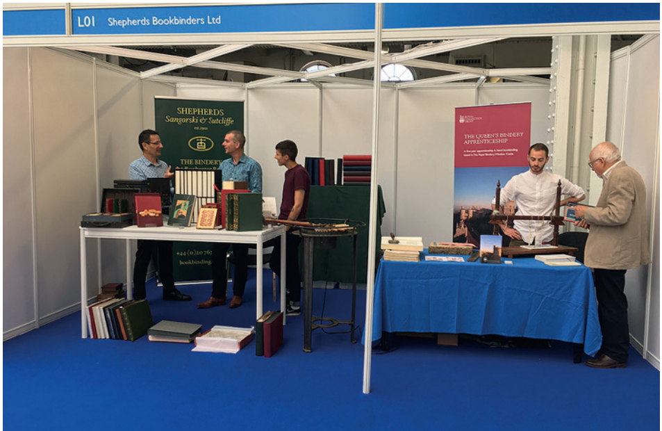
ABA London Book Fair