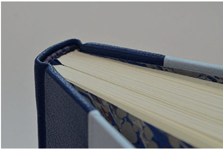
Half leather case binding, Ellie Lanham