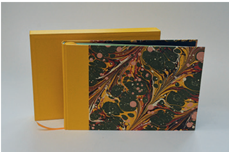
Photograph album and slipcase, Ellie Lanham