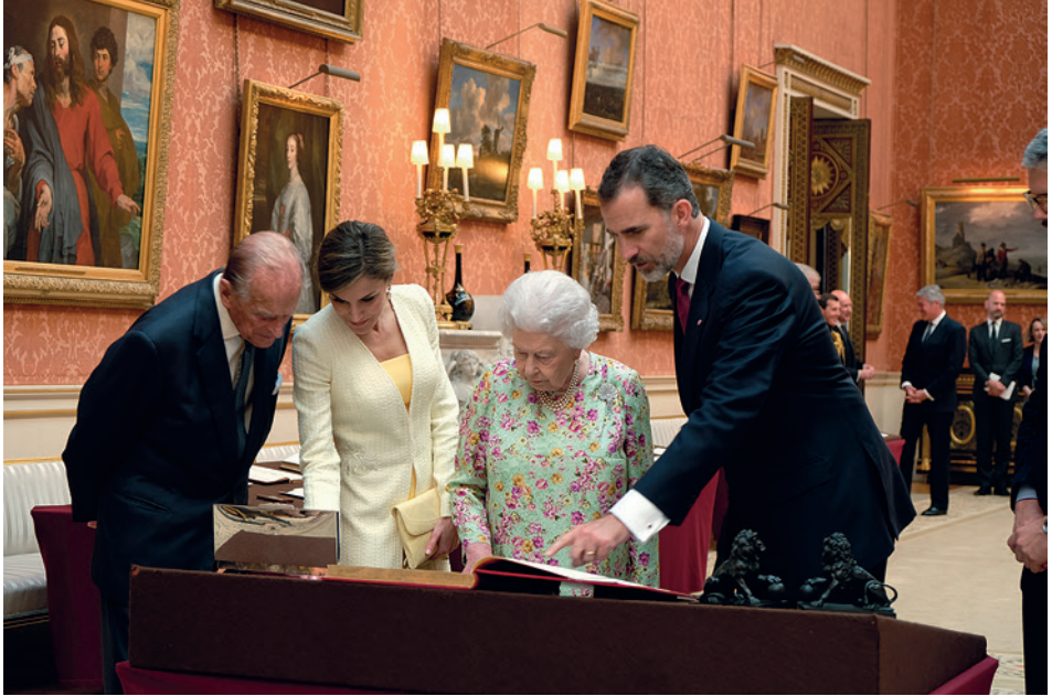
Spanish State Visit